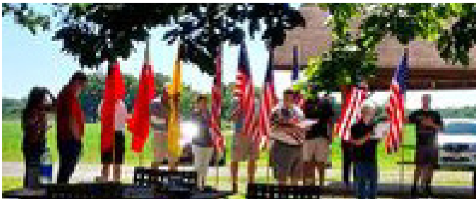
Flag Ceremony at the Farm

Non-Profit Organization U.S. Postage PAID Troy, Ohio Permit No.89