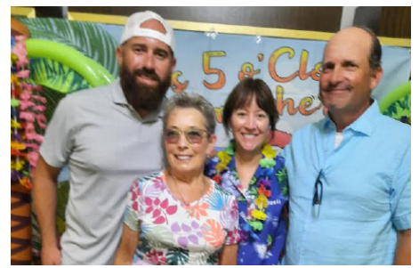
A few residents of Margaritaville